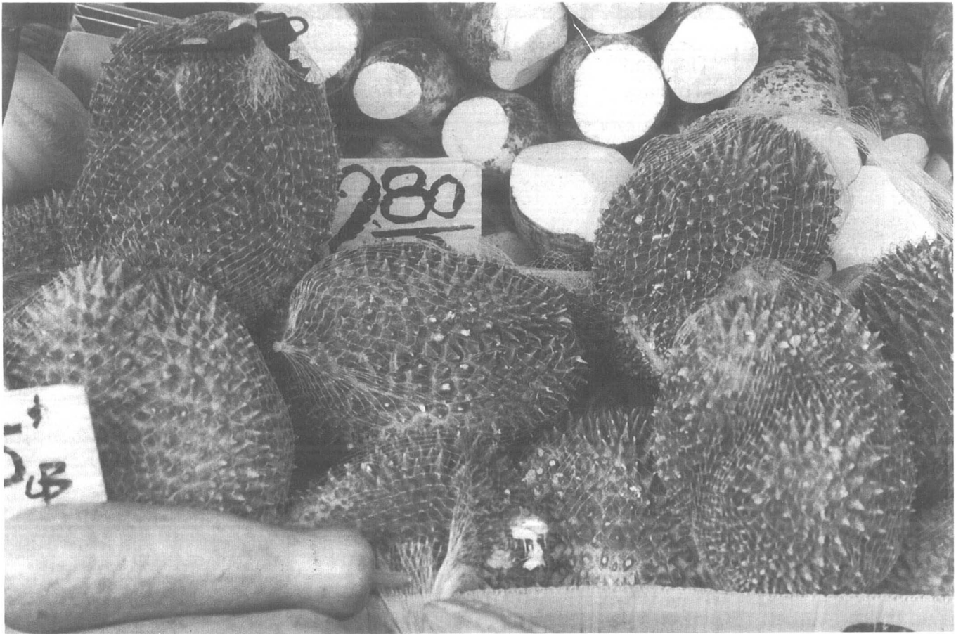
Durian for sale on the Chinatown market in New York City